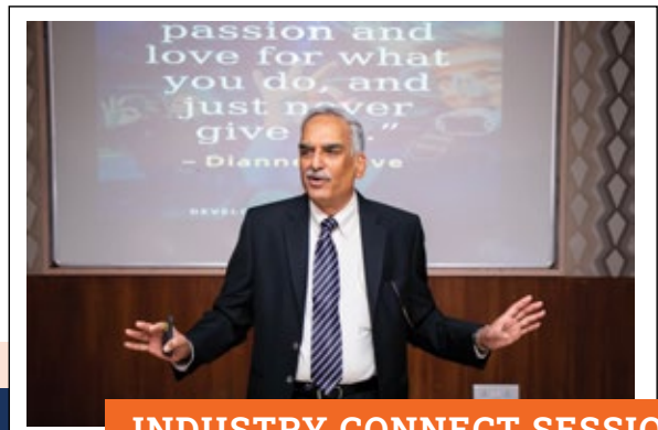
INDUSTRY CONNECT SESSION