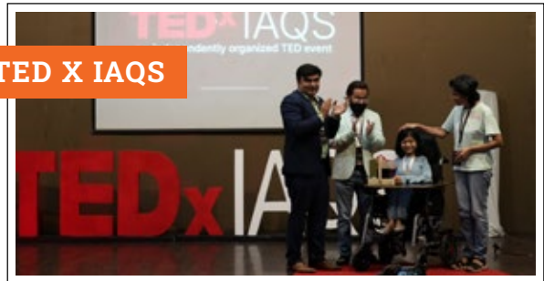
TED X IAQS